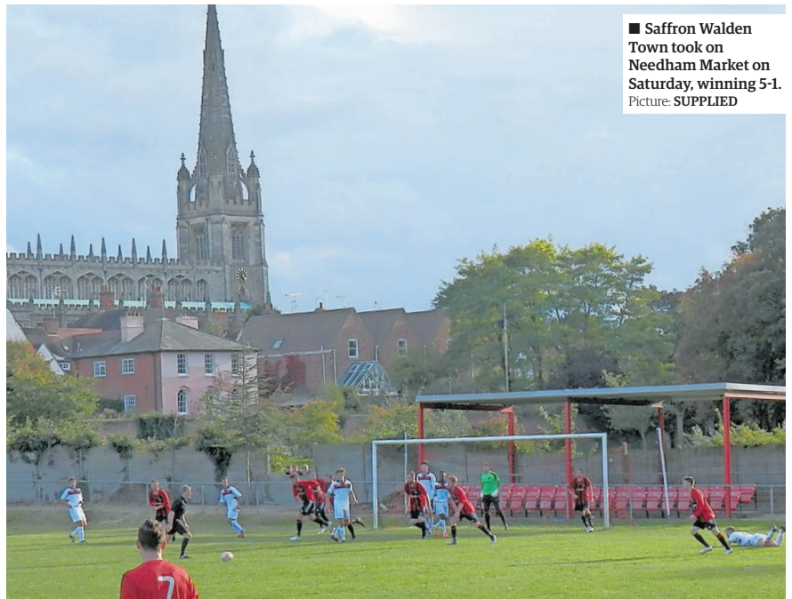
■ Saffron Walden Town took on Needham Market on Saturday, winning 5-1.